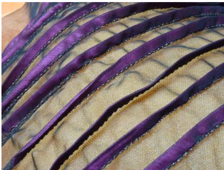
Ground fabric by Taubert Textil

Leading supplier of embroidery threads Madeira suggests ways in which lingerie and swimwear brands and private labels could use its products to personalize their creations.