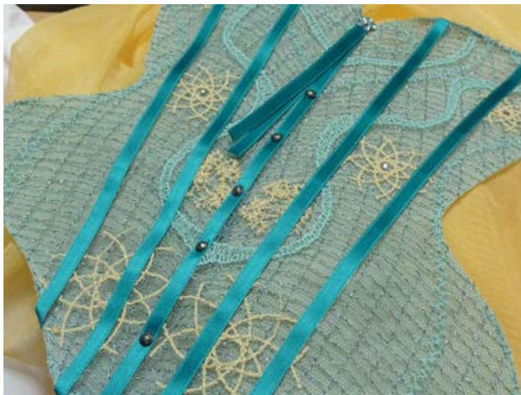
Ground fabric by Swisstulle