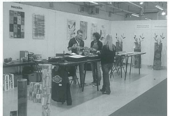
MADEIRA and IDEAS' joint stand at Performance Days

Because embroidery thread is considered simply a replaceable accessory, decision-makers often lack specialist knowledge. They outsource production and leave decisions to the producers. More often than not, this choice impairs the quality of the clothing. Many brands have become aware of this problem and are looking for experienced international partners, such as Madeira, to once again add more quality, innovation and diversification