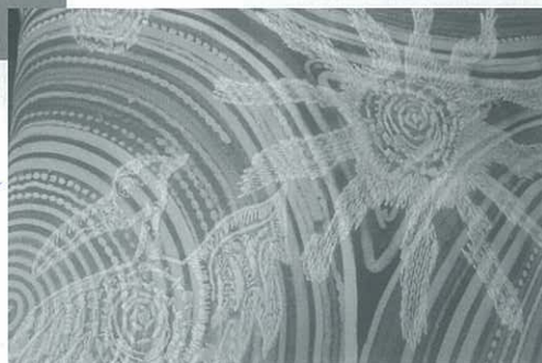
An explosion of colours with the wool blend thread BURMILANA

Fresh from two trade fairs, MADEIRA is already preparing for the autumn trade fairs taking place in September: Fabric Start in Munich and Mod Amont in Paris. These topics will be the subject of intense discussion there too. Under the motto “seams to be different”, Madeira will be showcasing not only embroidery applications, but also decorative seams, which will be exhibited in newly designed presentation books.