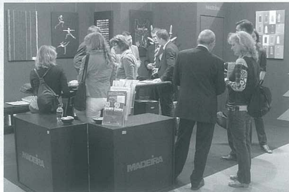
Keen interest in MADEIRA at Texprocess

created through these synergies breathe new life into the industry and help every member of the textile chain to decisively improve the quality of their products.”