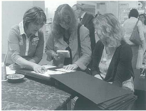
Inspiring people with the MADEIRA presentation books

Within the space of just a few days, Freiburg-based embroidery thread expert MADEIRA exhibited at two international trade fairs.